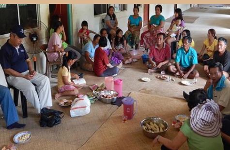
Fellowship at Tuai Rumah Igau

One generation commends Your works to another; they tell of Your mighty acts. Psalm 145.4