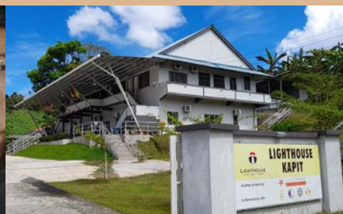
The newly renovated Lighthouse Kapit