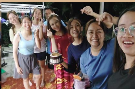
Iban ladies at Linaco Batu Pahat